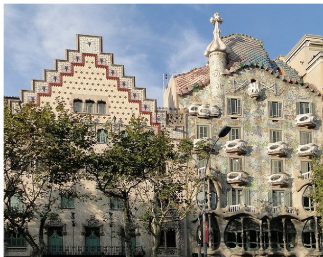
Partial view of Block of Discord at Passeig de Gràcia